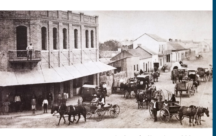
Rio Grande City, circa 1900

The walking tour encompasses ten sites and lets you go at the pleasure of your own pace. Explore the history of homes and commercial properties located in Rio Grande City's Downtown Historic District recognized by the National Park Service in 2005.